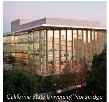
California State University, Northridge