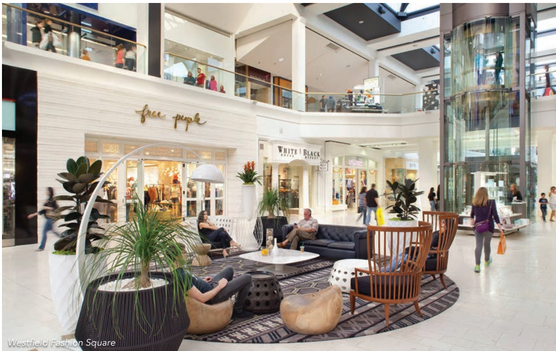
Westfield Fashion Square